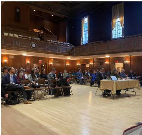
Arlington Town Hall

As the Legislature works toward an FY24 Budget, the Ways and Means Committee is on a hearing tour across the State to review the Governor's Budget. It is the duty of the Committee on Ways and Means to consider all legislation affecting the finances of the Commonwealth and such other matters as may be referred to us.