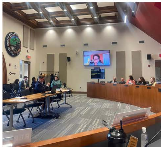
Fitchburg Town Hall